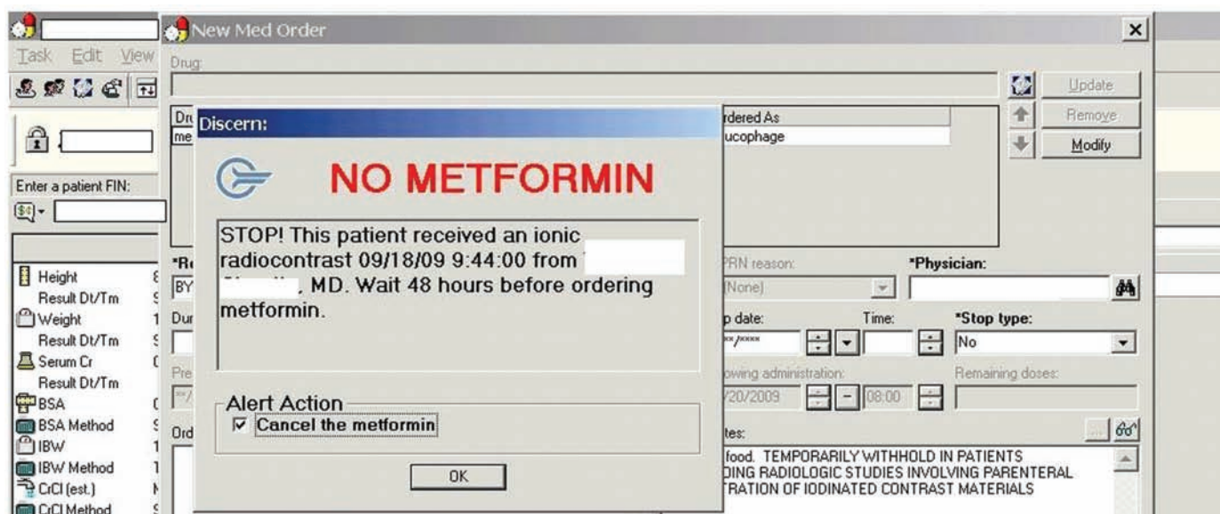
Figure 6 • Example of the alert that the pharmacist sees when filling an order for metformin on a patient admitted through the ER who received iodinated contrast.